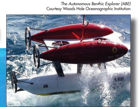
The Autonomous Benthic Explorer (ABE)