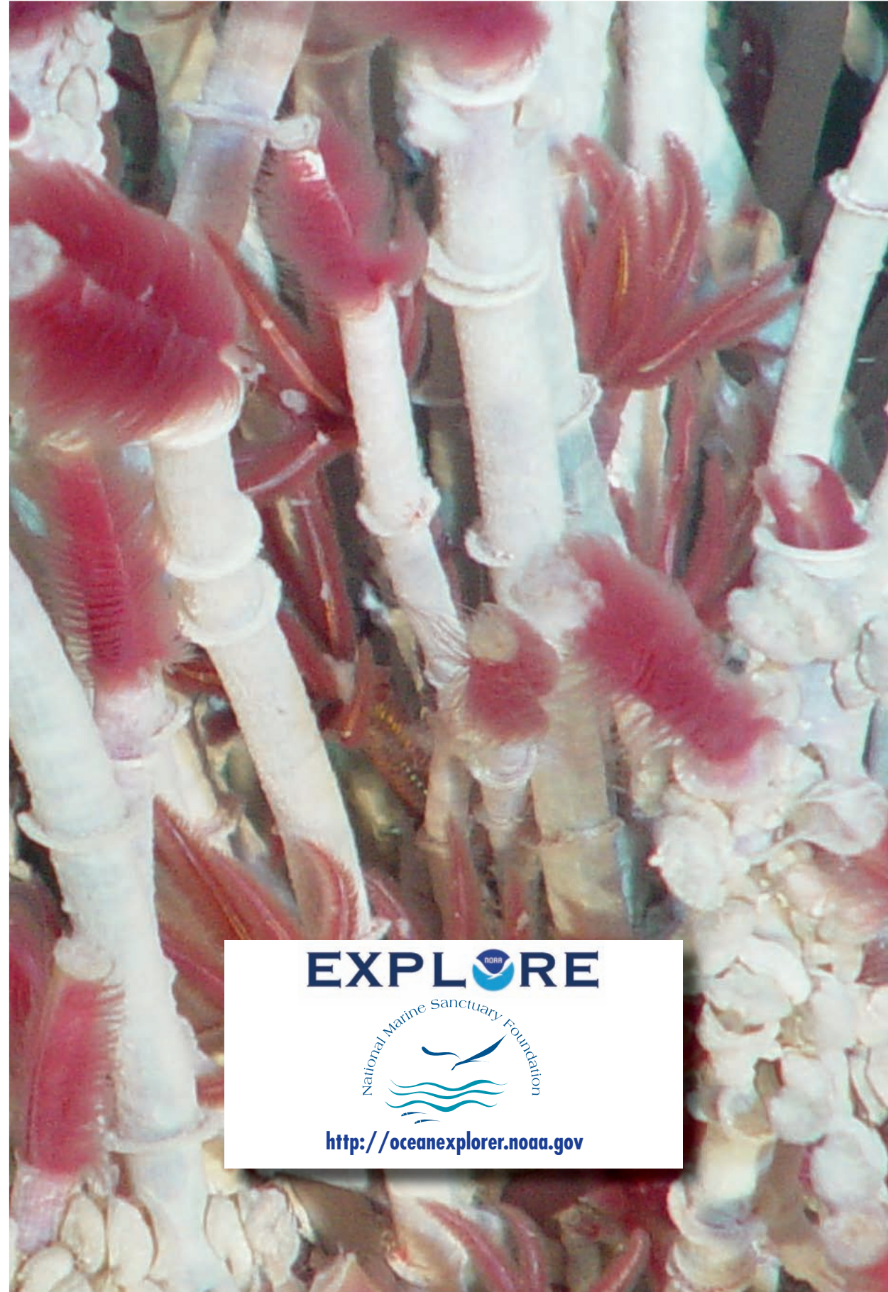
Tubeworms at vent site

Learning Ocean Science Through Ocean Exploration