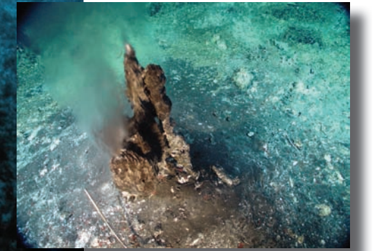
A deep-sea vent